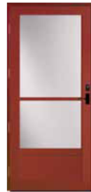
389 Self-Storing (Includes full screen*) ‡