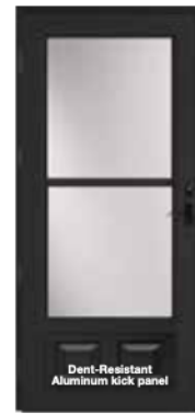
399-M Modern Self-Storing (Includes full screen) ‡ Dent-Resistant Aluminum kick panel