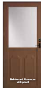
394 Provincial (Includes screen) ‡ Reinforced Aluminum kick panel