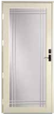
385 Full View Double Prairie with Beveled Glass (Includes screen*) ‡