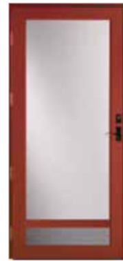
396-V One-Lite with fixed .023 gauge stainless steel screen ventilated bottom & removable sash (Includes top screen*) ‡ (Inspirations Glass available)