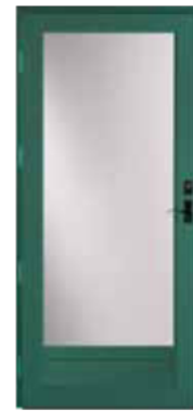
396 One-Lite (Includes screen*) ‡ (Inspirations Glass available)