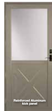
395 Crossback (Includes screen) ‡ Reinforced Aluminum kick panel