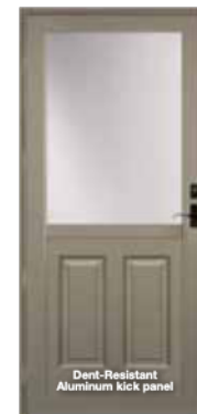
374-C Colonial Half-Lite (Includes screen) ‡ Dent-Resistant Aluminum kick panel