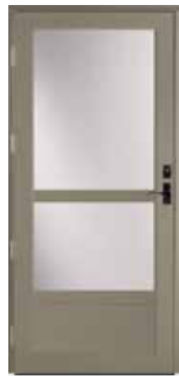
398 Hi-Lite (Includes top screen) ‡