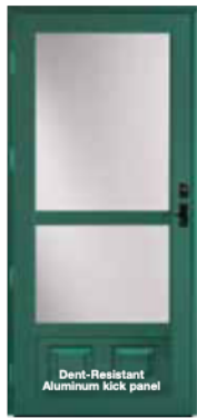
398-M Modern Hi-Lite (Includes top screen) ‡ Dent-Resistant Aluminum kick panel