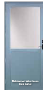
374 Flush Half-Lite (Includes screen) ‡ Reinforced Aluminum kick panel