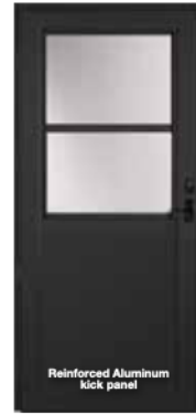
379 Self-Storing (Includes full screen) ‡ Reinforced Aluminum kick panel