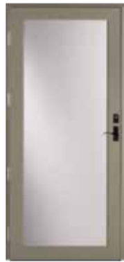
397 Full View (Includes screen*)