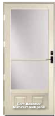
389-M Modern Self-Storing (Includes full screen*) ‡ Dent-Resistant Aluminum kick panel