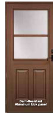
379-C Colonial Self-Storing (Includes full screen) ‡ Dent-Resistant Aluminum kick panel