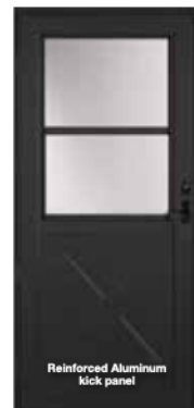
393 Crossback Self-Storing (Includes full screen) ‡ Reinforced Aluminum kick panel