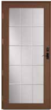
382 Full View with Beveled Glass (Includes screen*)