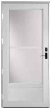
399 Self-Storing (Includes full screen*) ‡