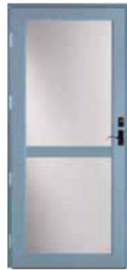
391 Full View Divided Lite (Includes top screen) ‡