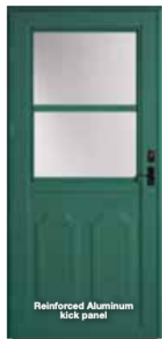
392 Provincial Self-Storing (Includes full screen) ‡ Reinforced Aluminum kick panel